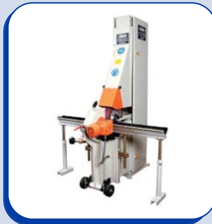
KS100 with optional V brush guide system