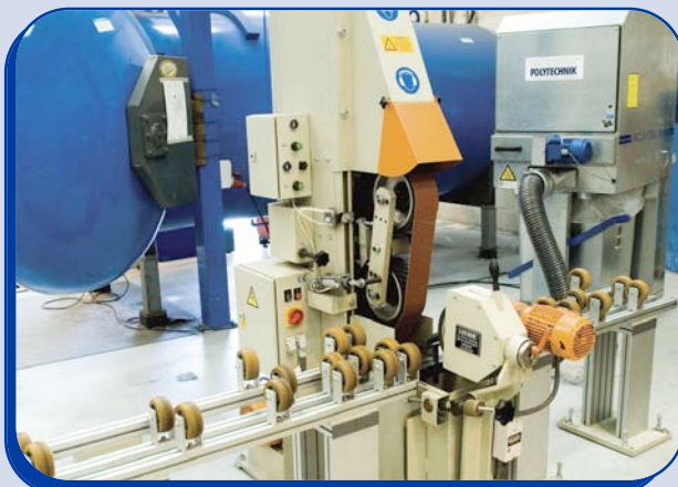
KS100 system with Mobile Extraction