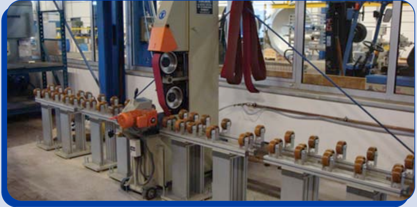
KS100 with additional 1m left and right roller guide extension options