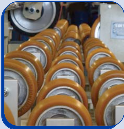
Roller guide system