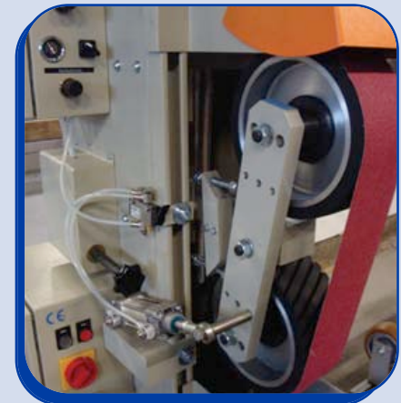
Pneumatic pressure control and adjustment